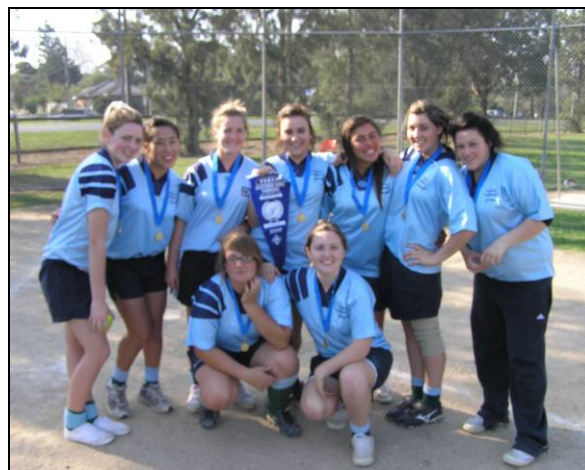
Eastern Zone Softball Champions