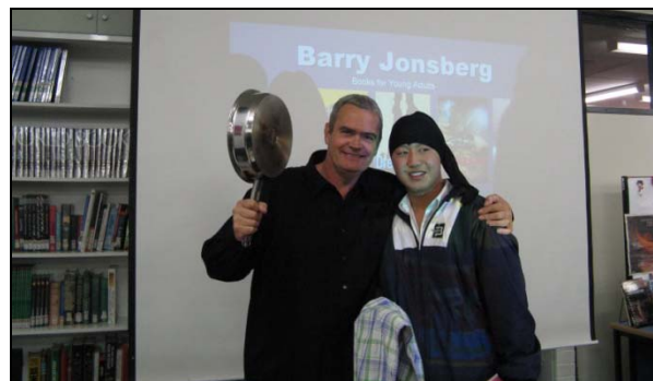
Barry Jonsberg with a student